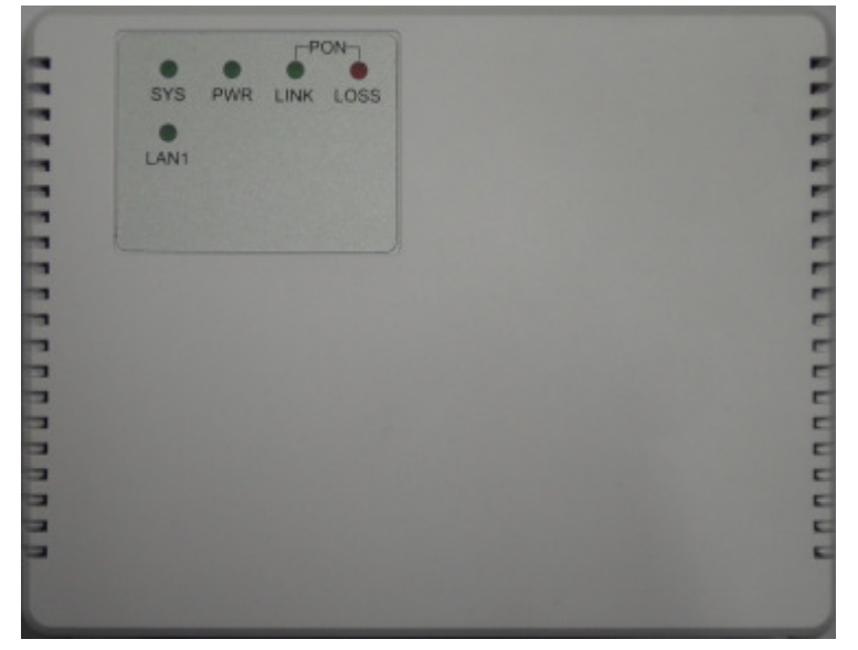
Figure 1-1 Front template of P1501C1

The front template of ONU P1501C1 is shown in figure 1-1: